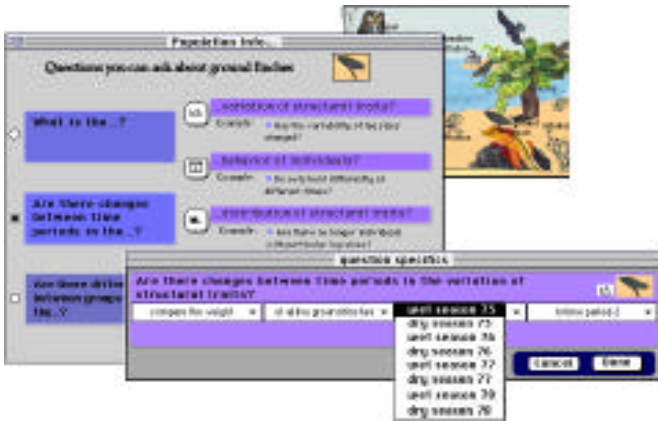
Figure 1. The questions interface and dialogue resulting from selecting "Are there changes between time periods in the..." - "...variation of structural traits?" In the dialogue students specify structure, group, and two time periods.